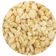
BROWN RICE (STANDARD DENSITY)