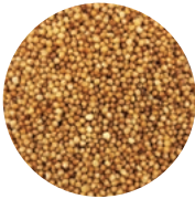
ARDENT MILLS GREAT PLAINS QUINOA™

The Annex by Ardent Mills offers unique, identity-preserved ancient and heirloom grains delivering texture and compelling stories – now in crisp form.