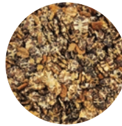
BLACKJACK™ BARLEY FLAKES