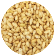
BROWN RICE (HIGH DENSITY)